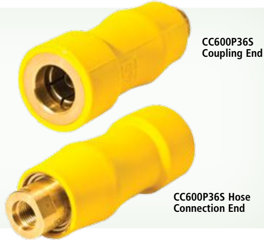
CC600P36S Coupling End

Seals: Specially formulated polymers and elastomers specific to high-pressure NGV applications