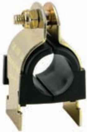
Gold Electro-Galvanized Steel